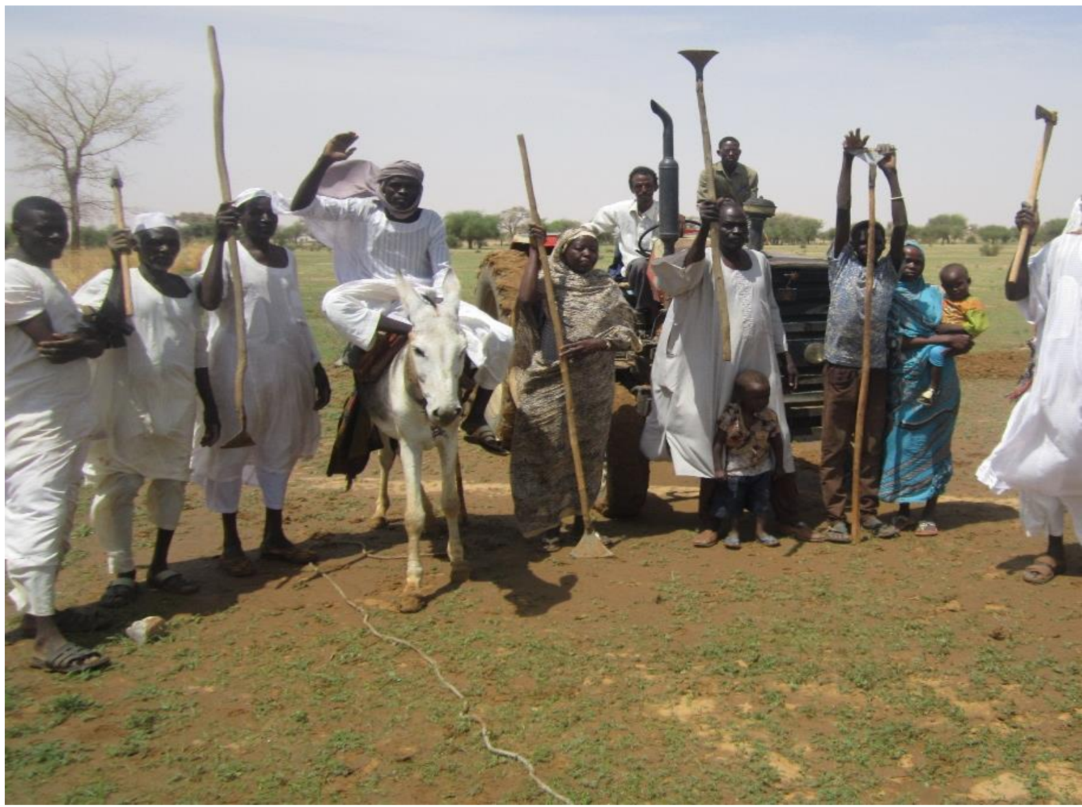
Figure 7: Farmers ready for field school lessons, Mellit, North Darfur

Commission, the Voluntary Return and Resettlement Commission and state Ministries of Agriculture, Animal Resources and Housing and Public Infrastructure.