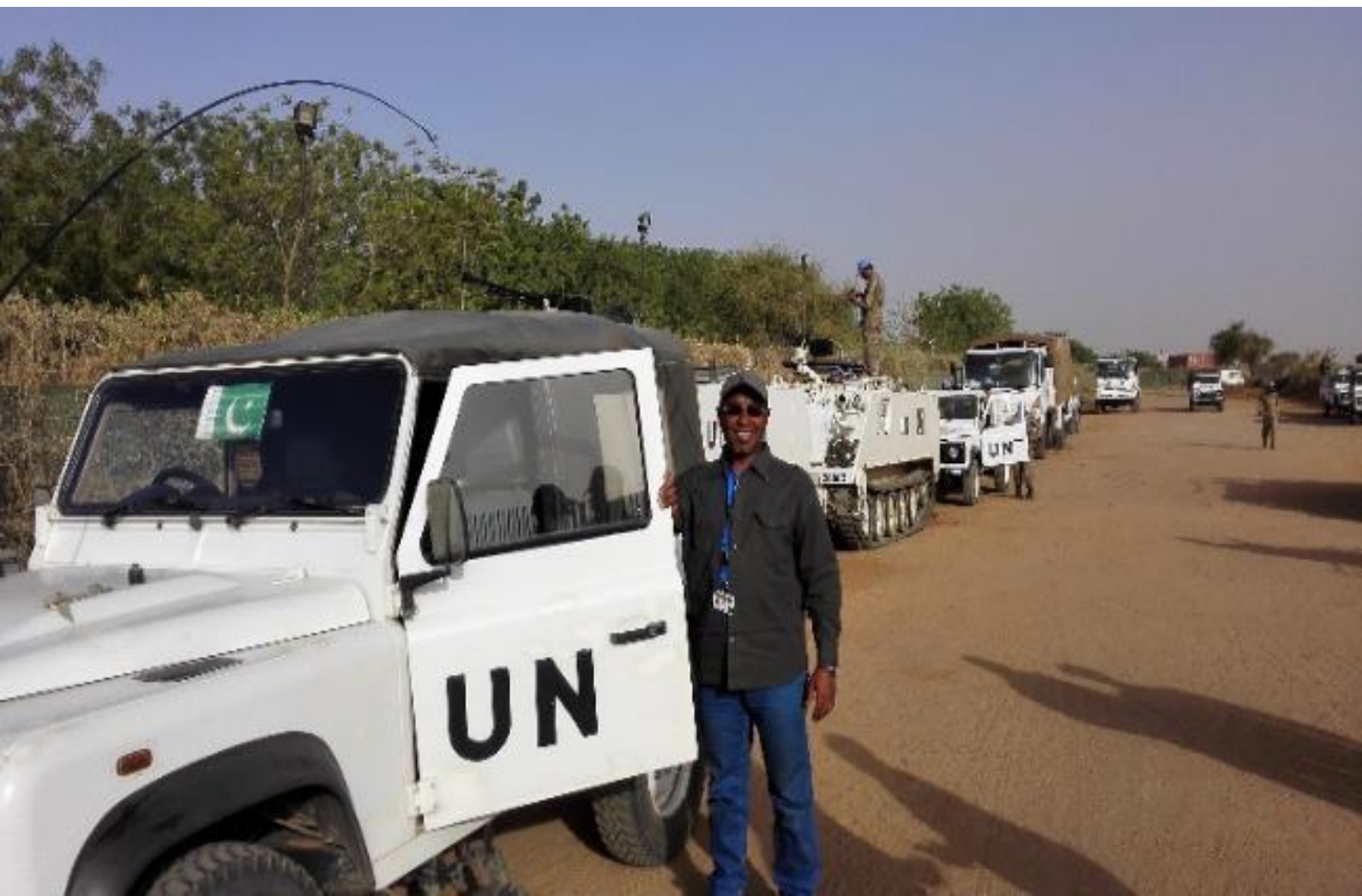
Figure 6: UNAMID convoy is used when travelling by road to project sites