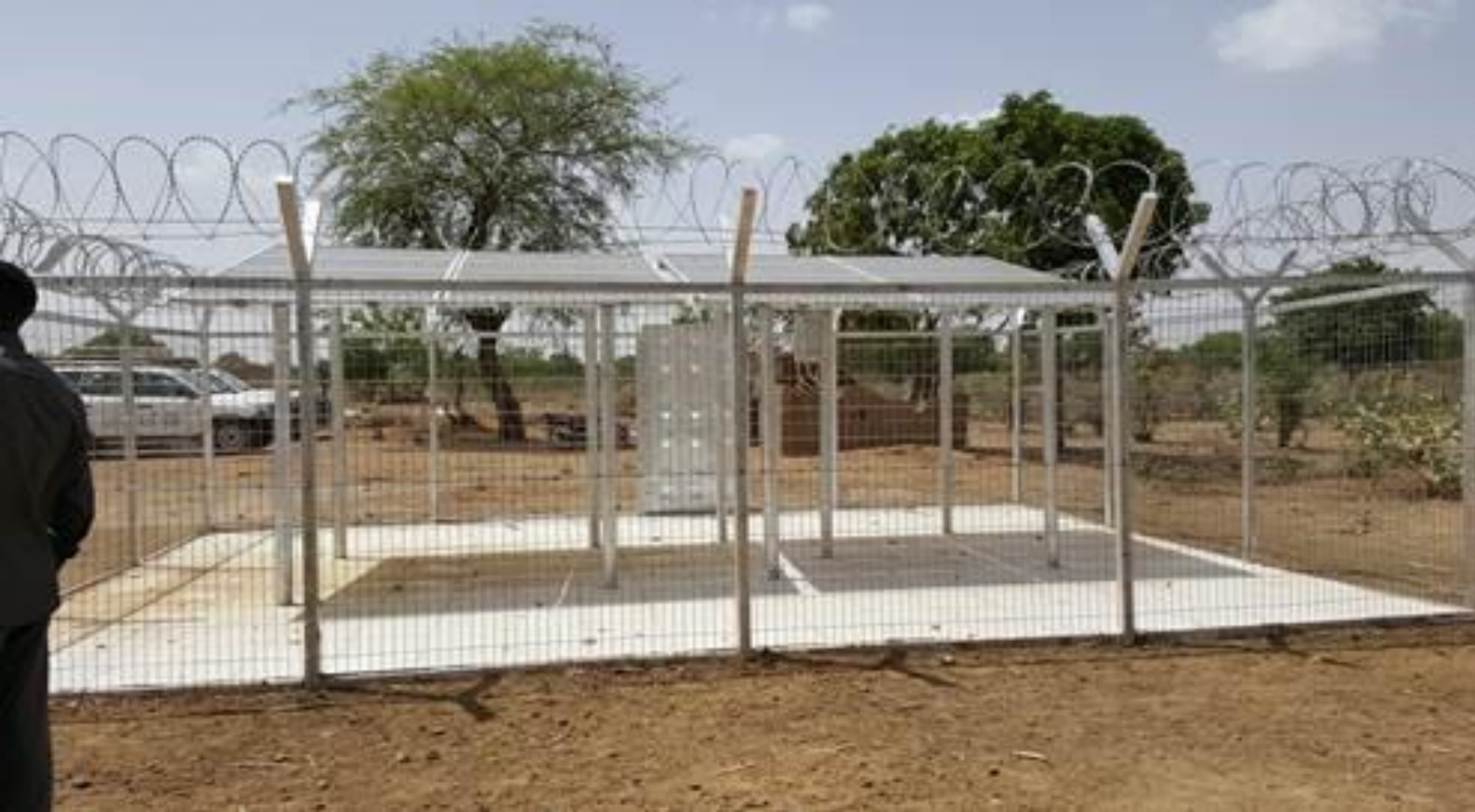
Figure 2: Solar motorised water supply system, Tandalti Community, El Geneina Rural Locality, West Darfur