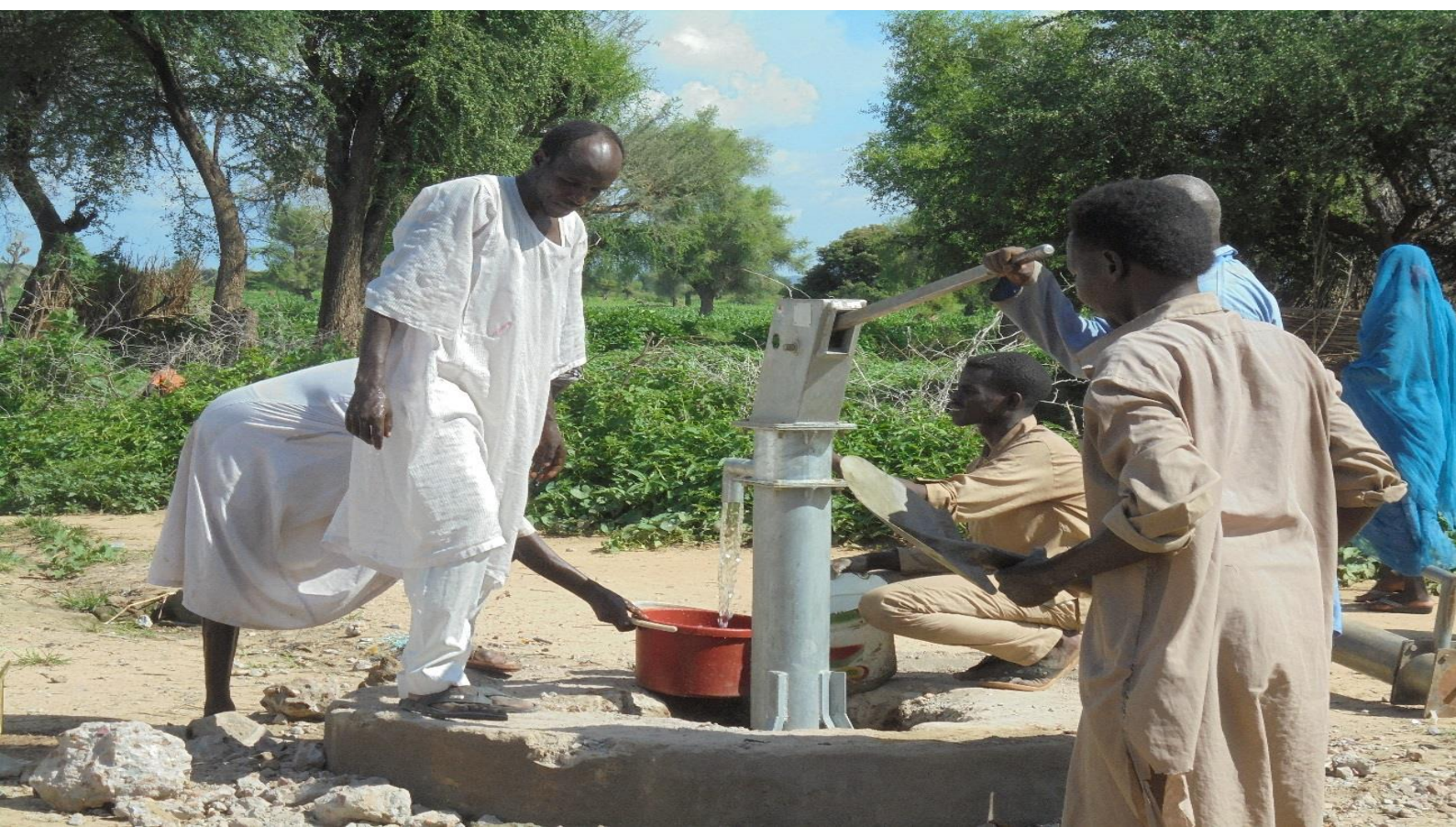
Figure 5: Repairing Hand Pump in Kurmandi, Azum Locality, Central Darfur