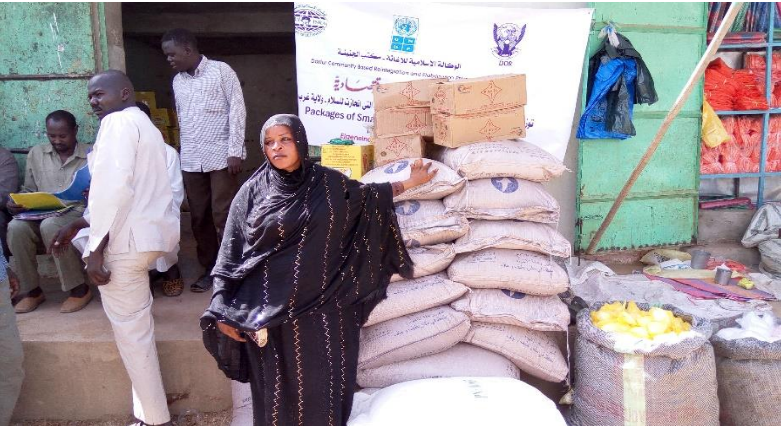
Figure 4: Delivery of small business package to ex-combatant in El Geneina, West Darfur